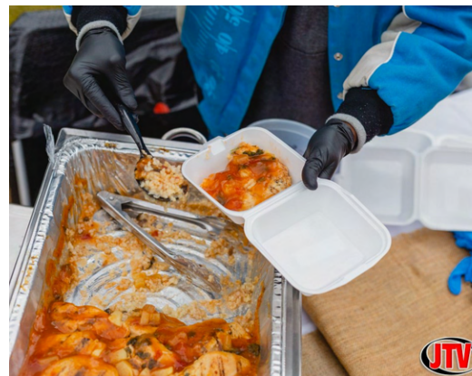
Davan Gerding (not pictured), Winner for Best Taste. Oct. 15, 2020