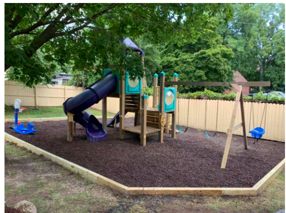
Kiwanis Club of Jackson funded and volunteered several hours to clean, plant and mulch the shelter yard