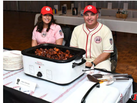
Winner for Best Tasting entry