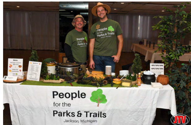
Winner for Most Creative Workstation

Thank you to the many local businesses who supported the silent auction, and the following event sponsors: