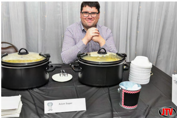
Winner for Big Tipper - most tips raised