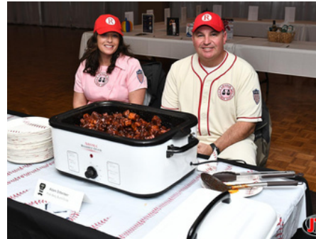
Winner for Best Tasting entry