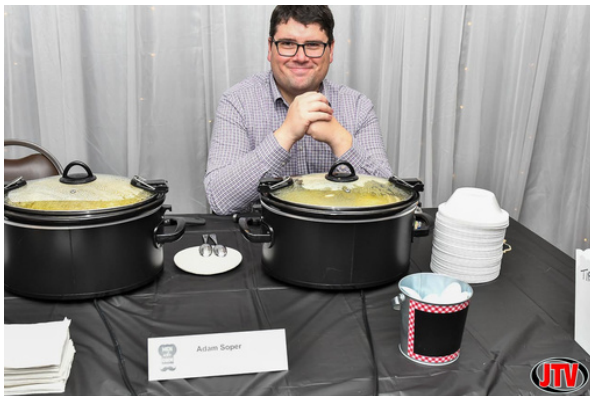
Winner for Big Tipper - most tips raised