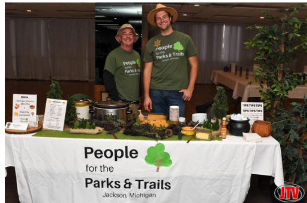
Winner for Most Creative Workstation

Thank you to the many local businesses who supported the silent auction, and the following event sponsors: