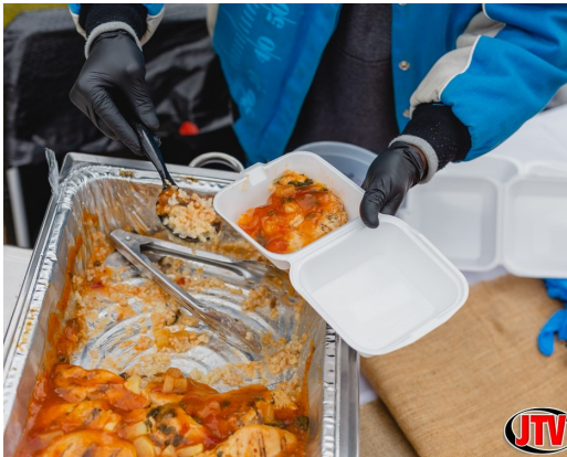
Davan Gerding (not pictured), Winner for Best Taste. Photo by Brooke Morse, Courtesy of JTV, Oct. 15, 2020