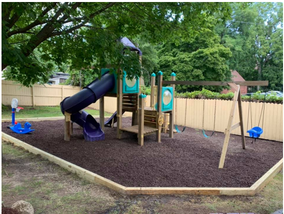
Kiwanis Club of Jackson funded and volunteered several hours to clean, plant and mulch the shelter yard