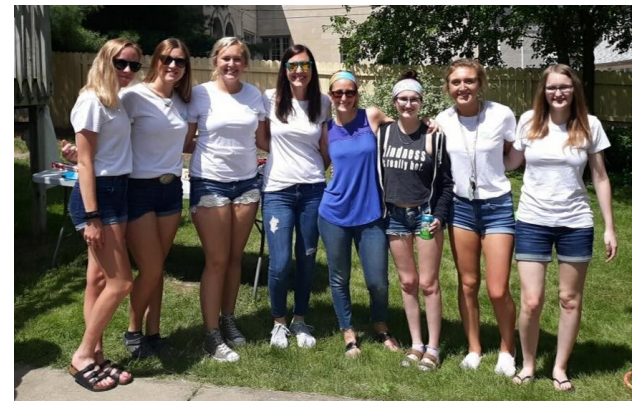
Jennifer Dale Photography and crew host a summer picnic for shelter residents with food and games for the children.